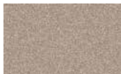
Champagne Pearl LT728