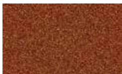
Classic Copper LT727