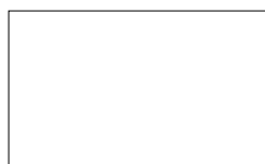
Whatever You Want