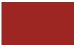
Carnival Red II LT726

Premier Colors require additional processing, lead times and cost. Please indicate desired paint system when ordering (70%, 50% or Baked Enamel).